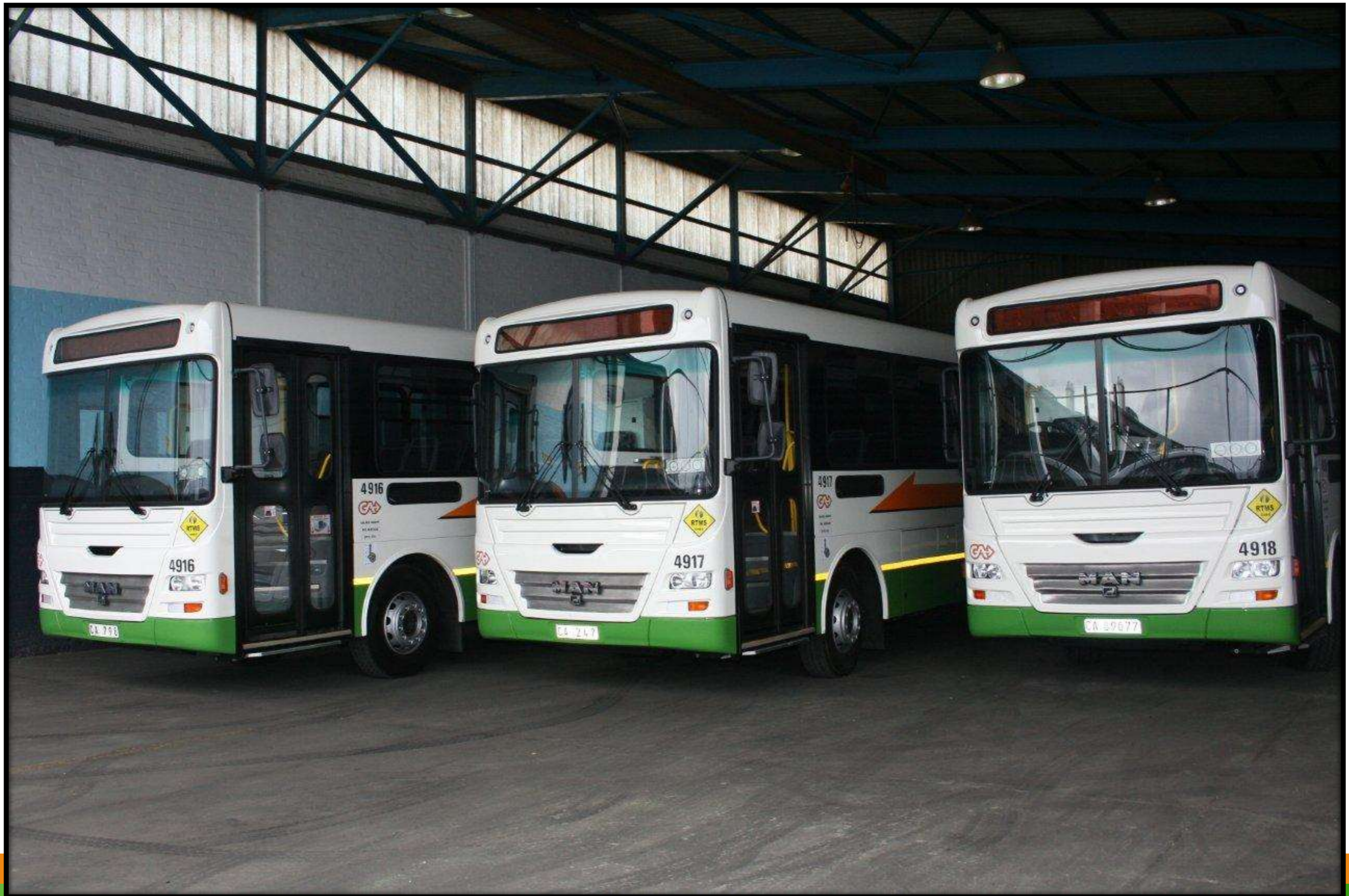
Golden Arrow bus Services