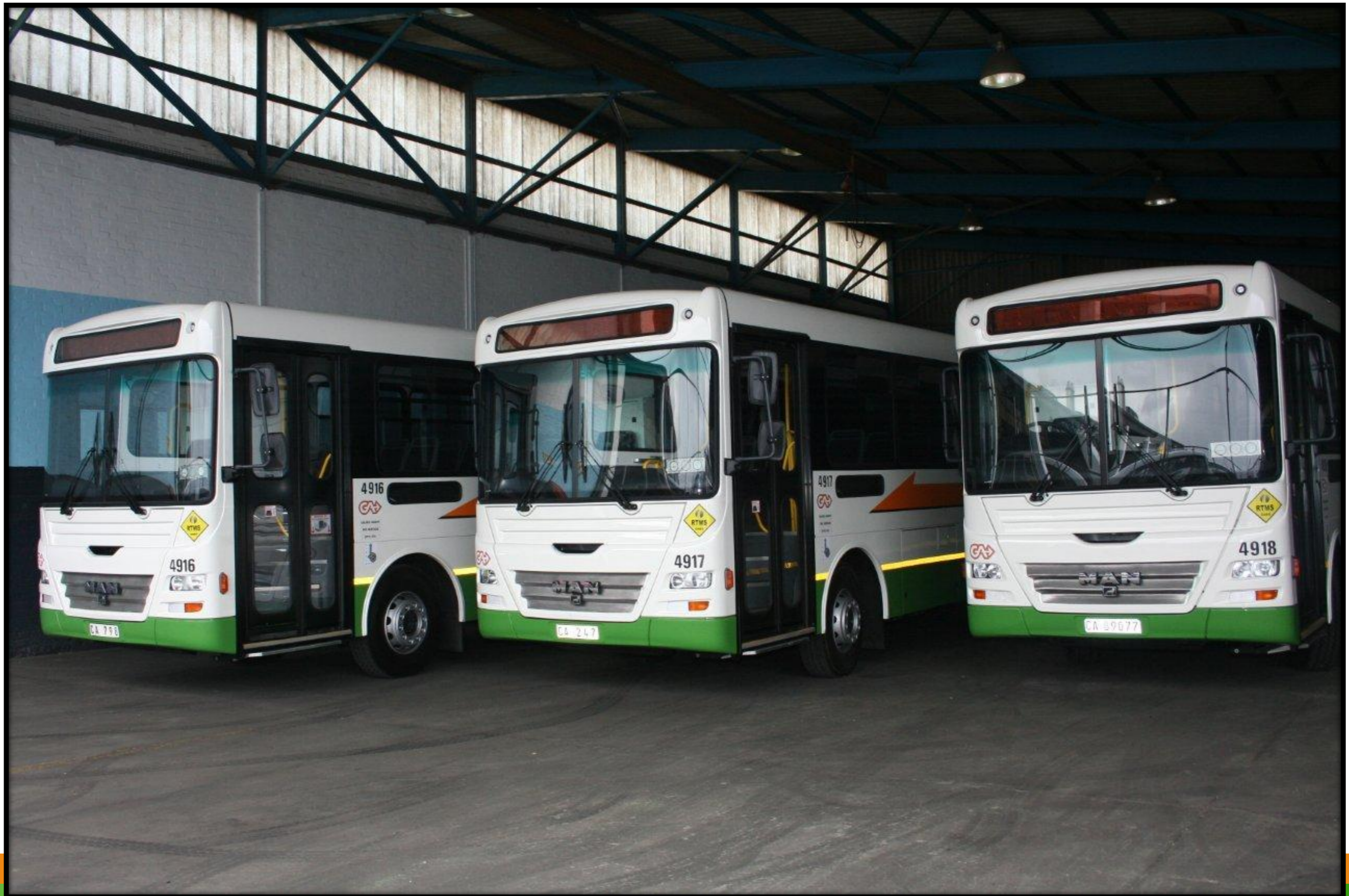
Golden Arrow Bus Services